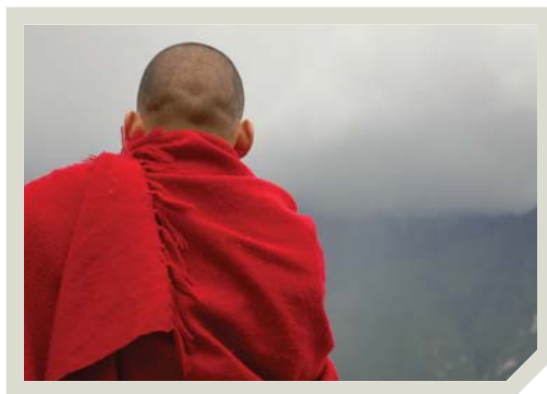
There are neural correlates of religious behaviours

Studies with hundreds of patients have estimated the frequency of religious experience to be between 1 per cent (Kanemoto & Kawai, 1994) and 2.3 per cent (Devinsky et al., 1991). Curiously, this seems to be much lower than the incidence of religious experience in the normal population, which varies between 20 and 60 per cent (Saver & Rabin, 1997), still it is worthwhile to look in detail at the case histories of this handful of hyper-religious patients. Of the 137 patients with TLE studied by Ogata and Miyakawa (1998), only three (2.2 per cent) were found to have had religious experiences. Curiously, all three had TLE with (again) psychosis and even more interestingly, in each case their mothers or mothers-in-law had profound influence over their religious or spiritual development. A more prosaic conclusion could be that they were hyper-religious because they were living in a religion-